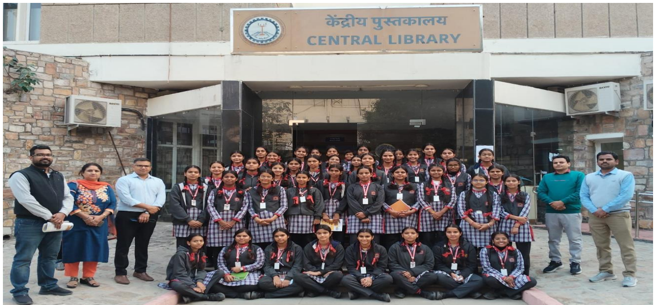
School Students visit from PM SHRI Kendriya Vidyalaya Itarana (Alwar)