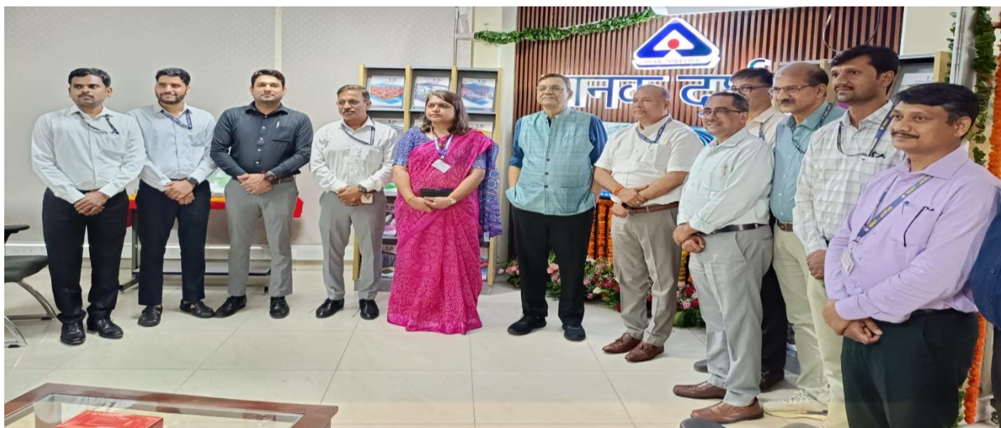
Inauguration of BIS Corner at Central Library