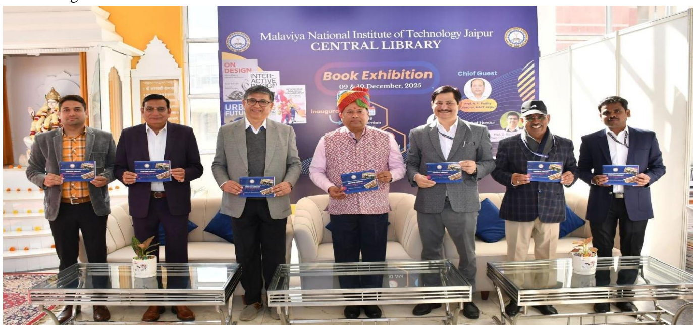
Releasing of the Central Library’s e-Resources Booklet during Book Exhibition